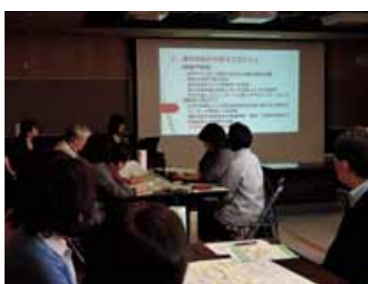
↑ Introduction to the Guideline