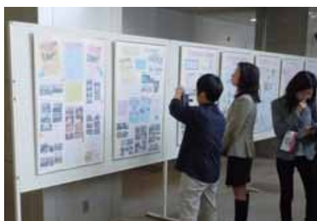
↓ DRR Program Panel Exhibition