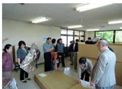
↑ Experiencing emergency shelter goods(cardboard bed and partition)