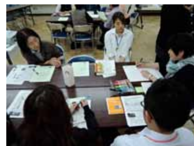
↑ Group discussion