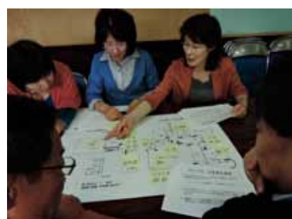
↑ Group work