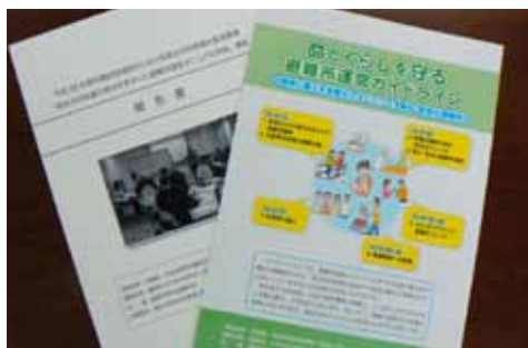
↑ Emergency Shelter Management Guideline